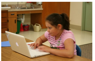
Using technology to aid learning!

targets empathy, listening, teamwork and self control. Each of the ADHD/EF classrooms is taught by a lead teacher and a behavior specialist. Parents are strongly encouraged to attend the parent education program that is included in the enrollment fee. At the end of the summer, students in these classes take home a classroom "Tool Box" so that you can support your child at home and school with their newly learned skills.