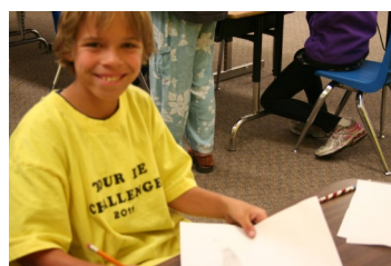
One of our Yellow Shirt Winners!

Tuition for the 2012 summer session is $2250.00. A $175.00 non-refundable deposit is required with your application. This deposit is applied to the total tuition fee. The remainder of the tuition is due on or before June 18, 2012. Partial financial assistance is provided by: Luther Burbank Savings of Palo Alto, The John A. Inglis Scholarship Fund, Mid-Peninsula Speech and Language Center, Several Private Foundations, and Individual Donors.