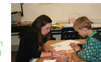
Small class size allows for one-on-one instruction.

age and instructional needs. Learning occurs in a fun theme-based curriculum. Students with learning disabilities receive a review of