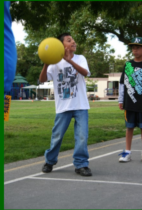
Enjoying a little recess break!

Students in the Traditional Challenge program demonstrate academic struggles as a primary concern. Some of these students have a diagnosed learning disability, such as dyslexia, (though it may co-