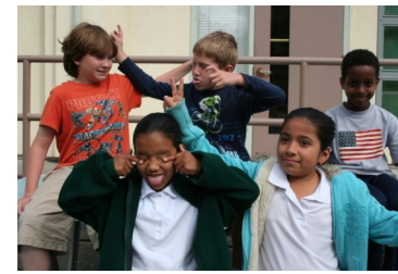
Having fun and making new friends while learning!

Students in the ADHD/ Executive Functioning (EF) program have ADHD as a primary