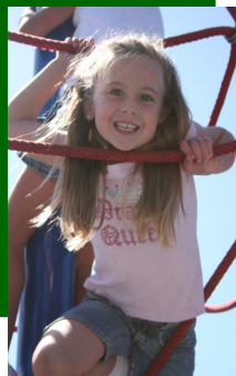
Challenge is Fun!

These include: audio-based books, word prediction tools, proofreading systems, as well as graphic mapping software for brainstorming and idea development. Parent conferences provide you with feedback on how well these strategies worked with your child, and what can be helpful for the upcoming school year.